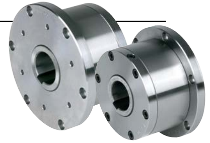
Back of AL..F2D2