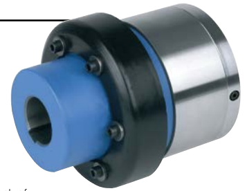
Back of AL..KMSD2