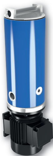
Off-line Filter Unit FNA 008/016