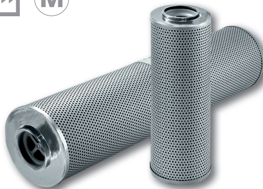
EXAPOR®AQUA Filter Elements