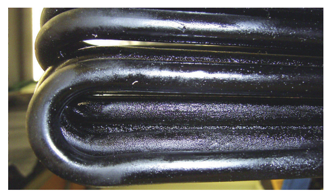
Oil aging products at tube bundles of an oil cooler