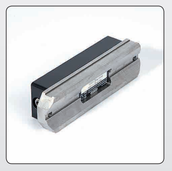
Precision prismatic base of hardened steel.