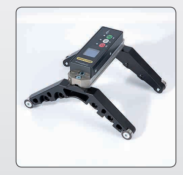
Legs for measurement on cylindrical surfaces with diameters larger than 55 mm. Accessory, Part No. 12-0901.

Easy-Laser® is manufactured by Easy-Laser AB, Alfagatan 6, SE-431 49 Mölndal, Sweden Tel +46 31 708 63 00, Fax +46 31 708 63 50, e-mail: info@easylaser.com, www.easylaser.com © 2017 Easy-Laser AB. We reserve the right to make changes without prior notification. Easy-Laser® is a registered trademark of Easy-Laser AB. Apple, the Apple logo, iPhone, and iPod touch are trademarks of Apple Inc., registered in the U.S. and other countries. App Store is a service mark of Apple Inc. Other trademarks belong to their respective owners. This product complies with: EN60825-1, 21 CFR 1040.10 and 1040.11. This device contains FCC ID: PVH0946, IC: 5325A-0946. Documentation ID: 05-0787 Rev3