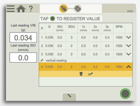
The XT280 connects to the XT Alignment App, making it possible to document the result as PDF, with photo and comments for each measurement point.