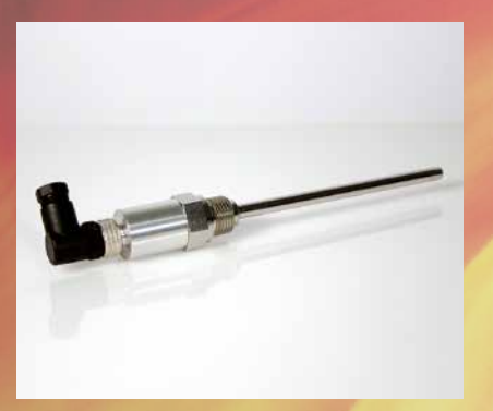
Temperature measurement technology