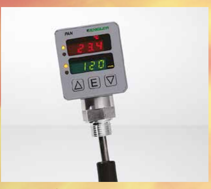
Level/temperature measuring method combined