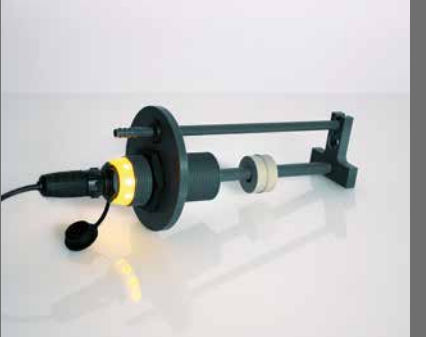
Individual product solutions

Engler measuring transducers have control over entrances for level, as over exits for current and voltage.