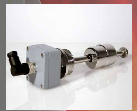
Level measurement technology

Cost-efficient. Economizing space. temperature measurement technology possibilities.